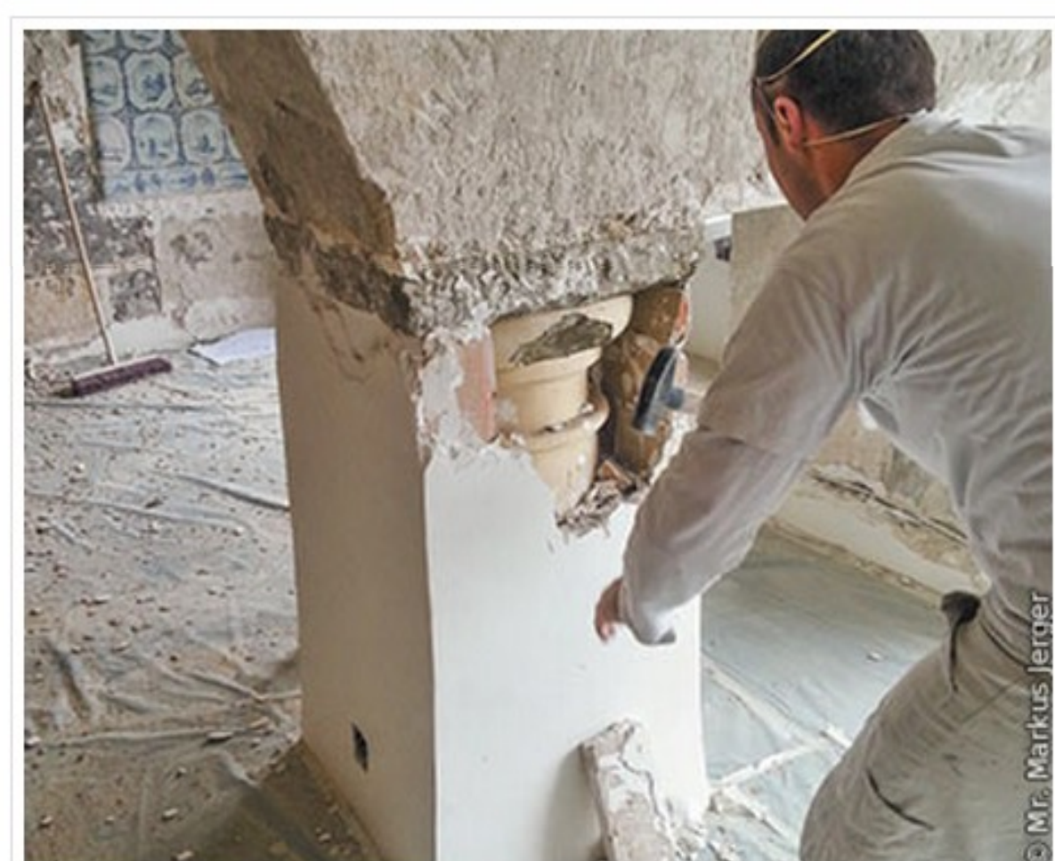
Discovery of the “Peace Column” in 2013

Lost engraved stone column found commemorating “La Société de la Paix”, the World’s First Peace Society, later succeeded by the League of Nations and the United Nations.